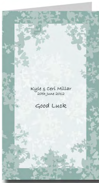
Small Lottery Ticket Holder